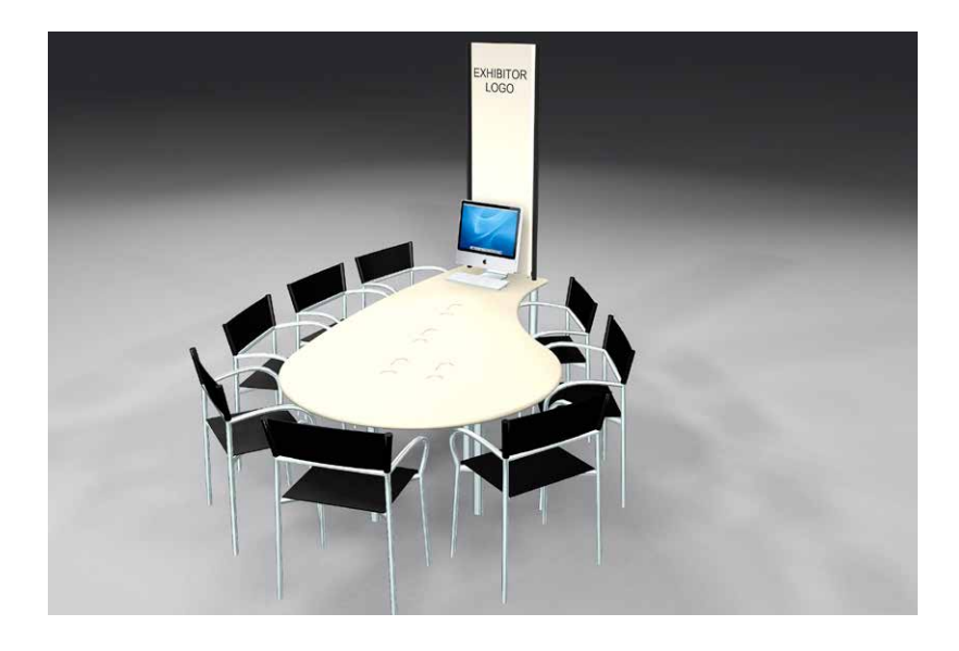
Table meeting point for all sponsorship levels

*Please note: 21% Spanish VAT applies to all companies based in Spain. EU-based companies with a valid VAT number and non EU residents will not be charged VAT.